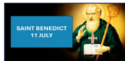
SAINT BENEDICT 11 JULY

WED No Mass Bombala Saint Augustine Zhao Rong & companions FRI Street Stall St Vincent de Paul